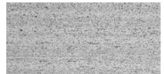
longitudinal section Ag/SnO 2 86/14 POX 1