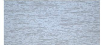
AgNi30 longitudinal section (parallel to the direction of extrusion)

The Ni particles are deformed along the direction of extrusion into fibres