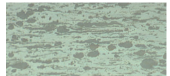
Ag(FeRe5)8.8 Cross Section